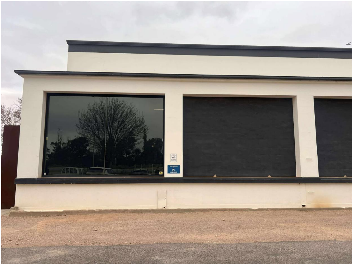
Figure 4 - Accessible Parking