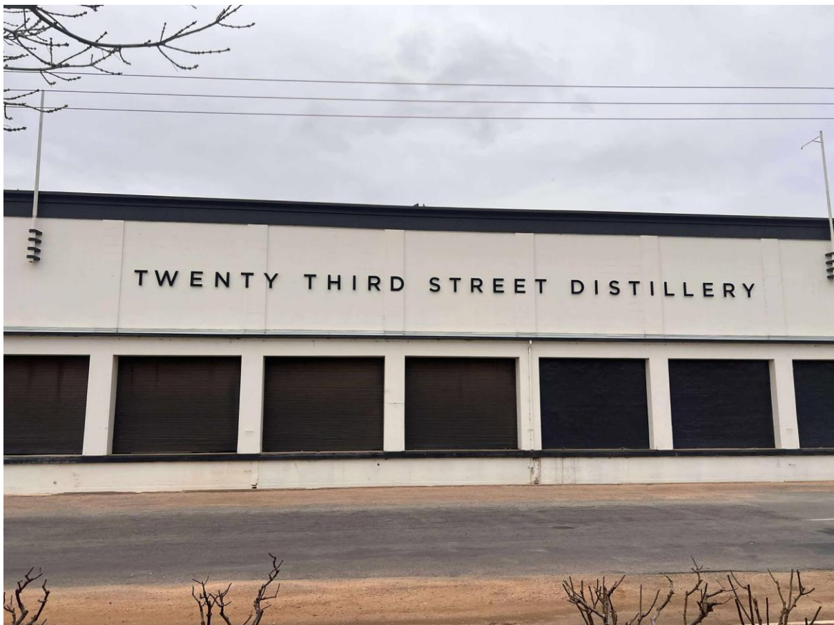
Figure 2 - Signage affixed to building

Visitors can identify the building by its heritage façade and distinctive glass distillery tower. Large “TWENTY THIRD STREET DISTILLERY” signage is affixed to the building, and council-installed brown tourism wayfinding signs are visible when entering and exiting the Renmark township.