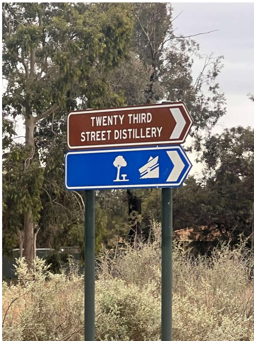
Figure 3 - Council Wayfinding signage